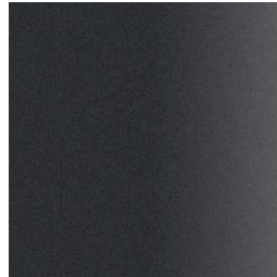
111 FT graphite fine textured