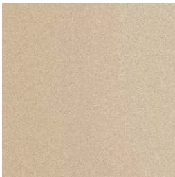
109 FT champagne fine textured