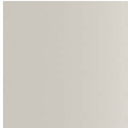
102 FT light grey fine textured