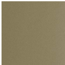
110 FT bronze fine textured