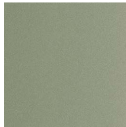
113 FT sage fine textured