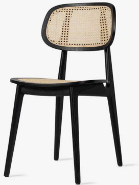
TITUS BLACK STAINED OAK