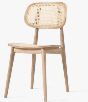
TITUS NATURAL VARNISHED OAK