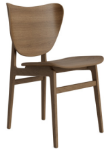
LIGHT SMOKED OAK