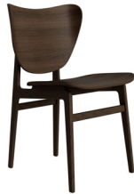
DARK SMOKED OAK