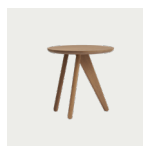
LIGHT SMOKED OAK