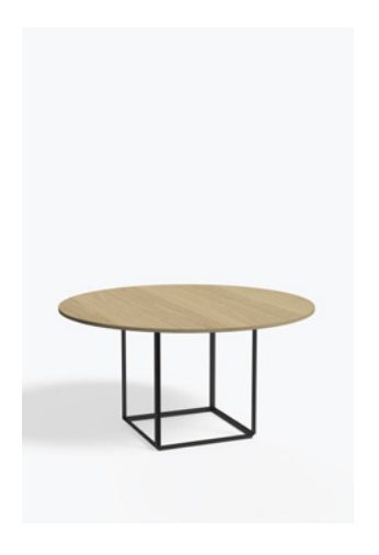
Walnut w. Black Frame